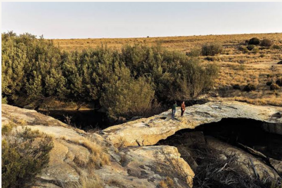
Natural Sandstone bridge